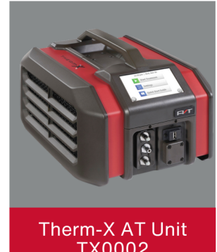
Therm-X AT Unit TX0002