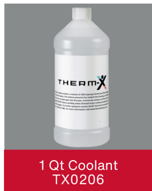
1 Qt Coolant TX0206