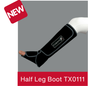
Half Leg Boot TX0111