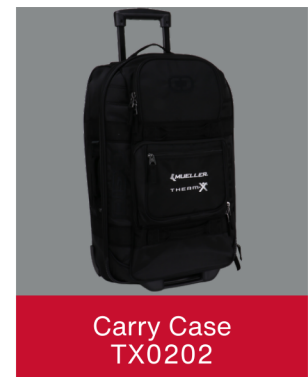
Carry Case TX0202