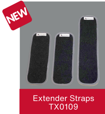
Extender Straps TX0109