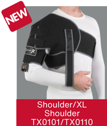
Shoulder/XL Shoulder TX0101/TX0110

Therm-X® garments are bilateral so you don't have to buy lefts and rights. They're one size fits all , and have high-end Velcro to last the life of the garment. The inner face uses a ripstop nylon with a waterproof backing to prevent buildup of mold and mildew after cleaning.