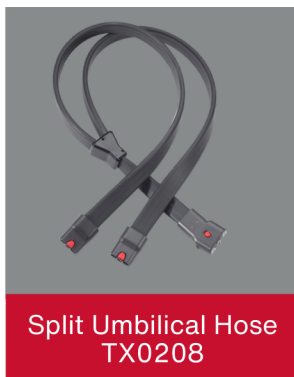
Split Umbilical Hose TX0208